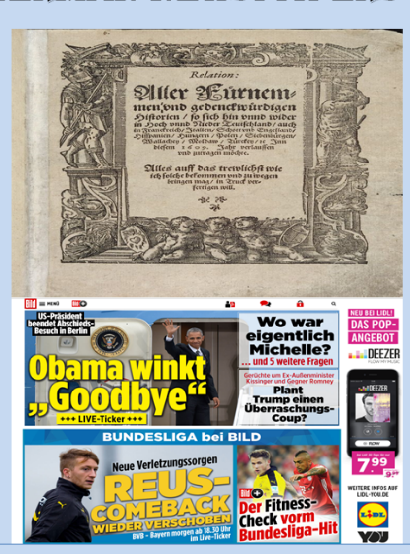
Bild was founded in 1952, and is based in Hamburg. It is classed as a tabloid, and uses large photos to illustrate its headlines.

The first German newspaper was Relation aller Fürnemmen und gedenckwürdigen Historien (Account of all distinguished and commemorable news), published by printer Johann Carolus in Strasbourg in 1605.