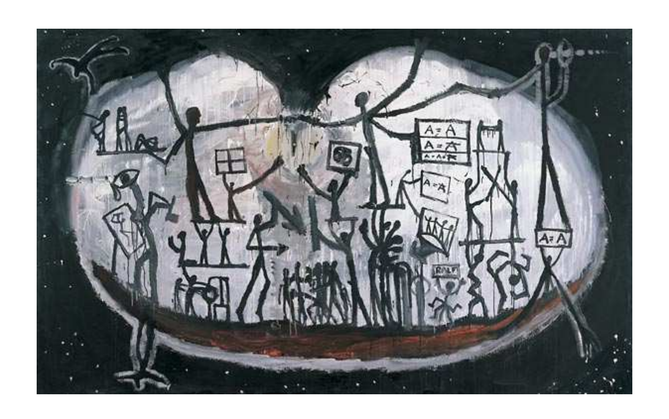
A.R.(alf) Penck, Großes Weltbild 1965 "large picture of the world"