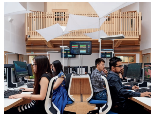
EBS trading floor

Go online for the complete picture of life in and around our Colchester Campus and to see our range of accommodation. www.essex.ac.uk/life