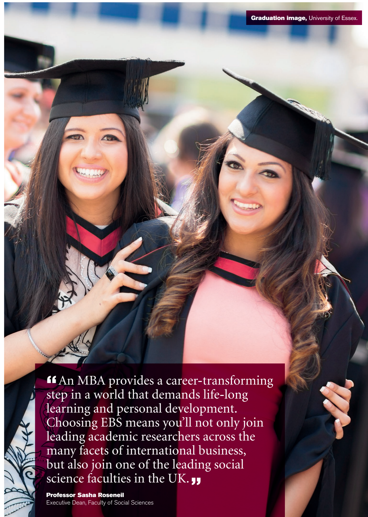
Graduation image, University of Essex.

“An MBA provides a career-transforming step in a world that demands life-long learning and personal development. Choosing EBS means you’ll not only join leading academic researchers across the many facets of international business, but also join one of the leading social science faculties in the UK.”