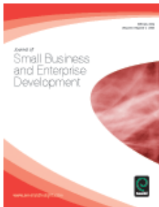
Journal of Small Business and Enterprise Development (JSBED) (ISSN: 1462-6004)

Selected papers will be considered for special issues of or submissions to the following journals: