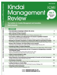
Kindai Management Review (ISSN No. 2186-6961)