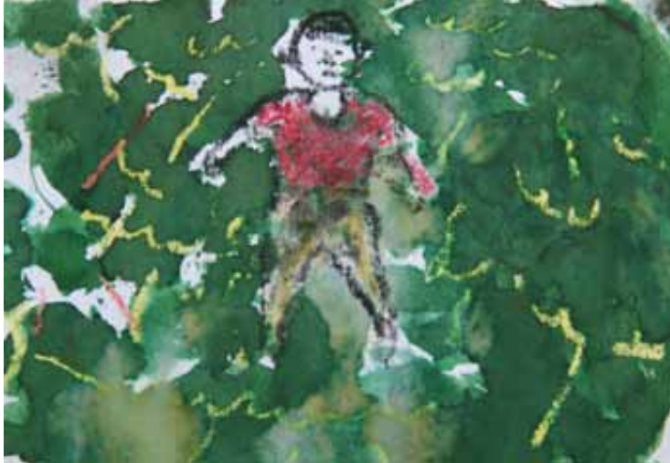
Thinking too much about my problems

Children also talked about feeling anger. The main thing that causes anger is the unjust way in which they are treated. Not being paid what they were promised is something that particularly makes children angry. Verbal abuse is another thing that makes children feel angry.