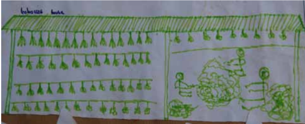
Sorting and grading tobacco