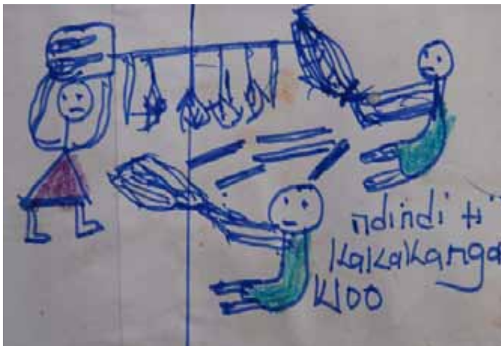
Harvesting and bundling tobacco