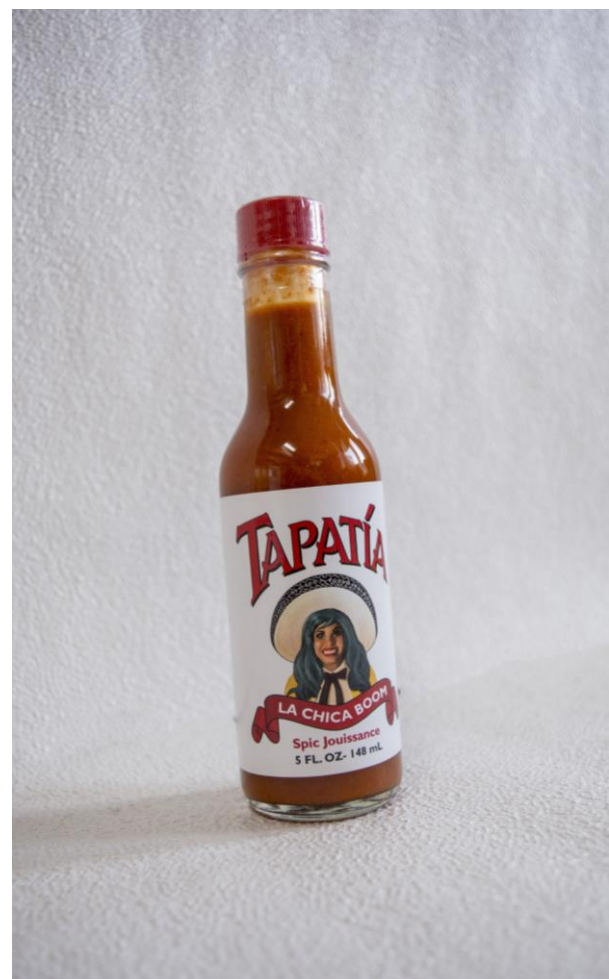
Fig. 2 Spic Jouissance Bottle , 2014, glass, inedible sauce, paper.

the immigrant subject continuously appears through the labor of food, Ibarra maneuvers this labor to upend this trajectory and instead carries it as a crystal, spicy lesbian phallus that can be handled to queerly penetrate politics. I discuss here her employment of the Tapatío strap-on across her performance and visual output and its aesthetics of sex and humor. After all, the power of her performances is often achieved through irreverence, play and humor to the point of discomfort.