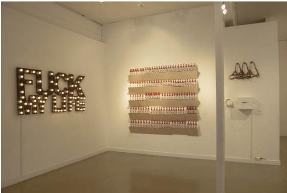
Fig. 1 Xandra Ibarra’s ‘Ecdysis: The Molting of a Cucarachica’ exhibition (gallery view), 2015, Galería de la Raza, San Francisco.

transformed, the gender designation adjusted to spell Tapatía , the “salsa picante” banner replaced with La Chica Boom’s name, and instead of the descriptor “Hot Sauce” the words “Spic Jouissance”.