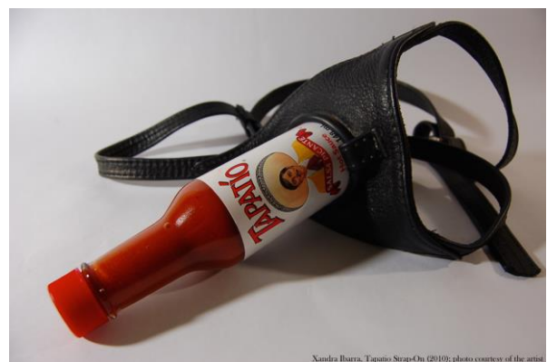
Fig. 4 Tapatío Strap-On , 2010, photograph.

close-up of her mouth, smiling, the cotton canvas stretched by rope. The forced grin in this extreme close-up becomes almost disconcerting, highlighting the S/M elements in the pieces. It also functions as a mediator between Ibarra's most recent persona, as a cucaracha in the process of molting into her next incarnation. This summation of objects narrates and conjoins the visceral elements present in them. It stretches literally from the smile and concentration on the mouth to the makeshift materiality of the faux phallus. It offers not a body without organs, but a jocular body that synthesizes and returns the contradictions of the Mexican body and her food, her mouth, her vagina, her spicy cock.